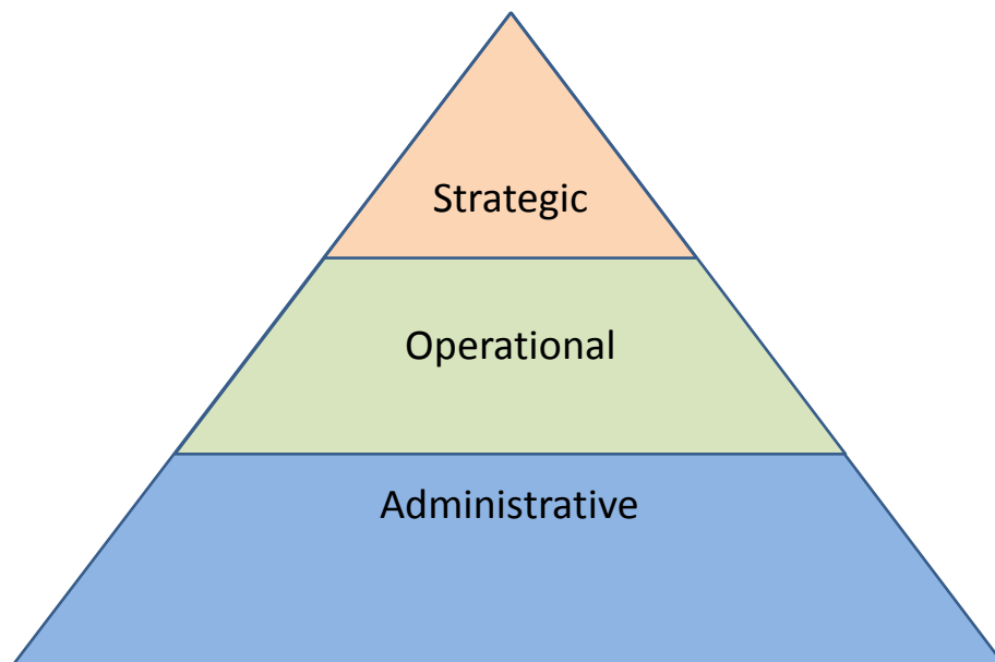
Figure 1: Levels of a QMS for interoperability testing

The QMS for interoperability testing can be constructed from three levels as shown in Figure 1.